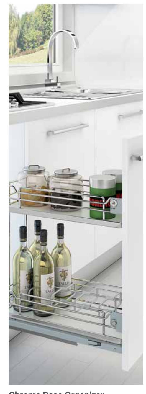
Chrome Base Organizer