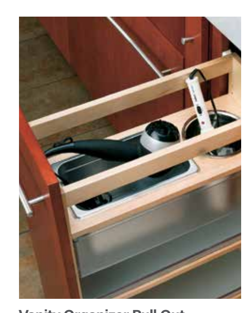
Vanity Organizer Pull Out