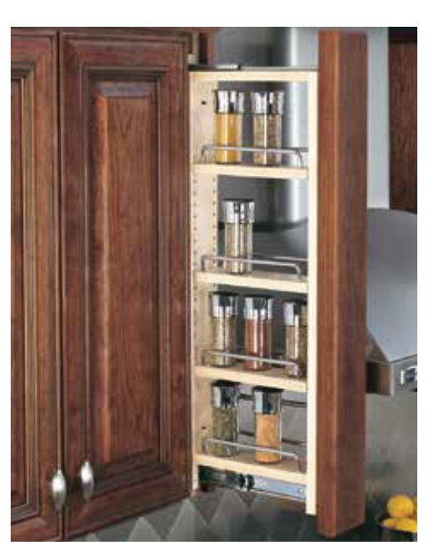
Wall Filler Spice Pull Out