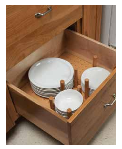
Adjustable Plate Organizer