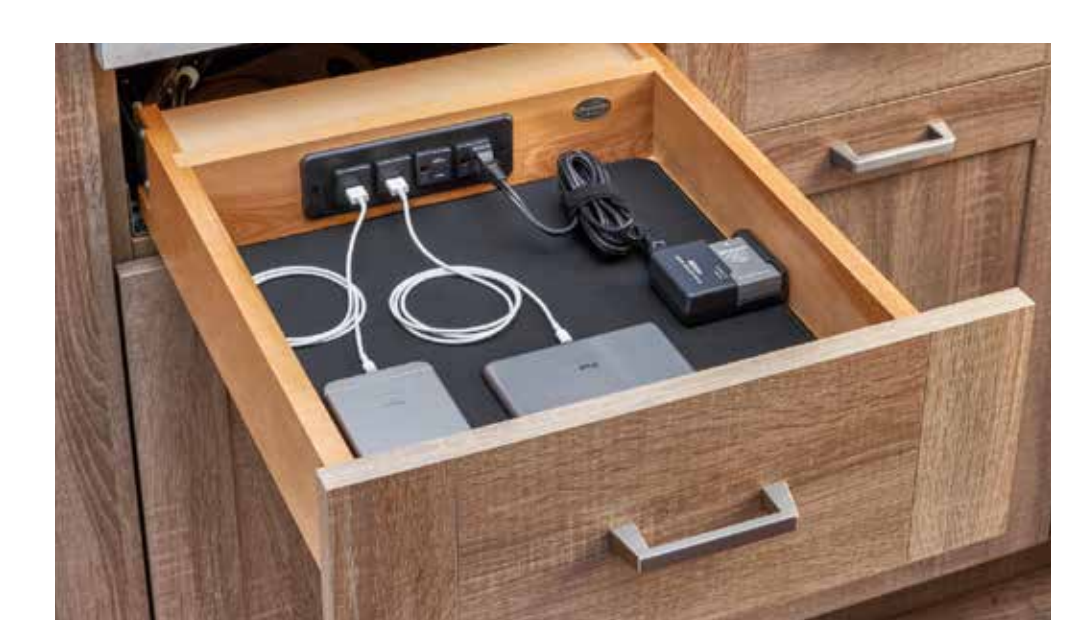
Maple Charging Drawer