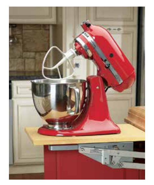
Pop Up Mixer Shelf