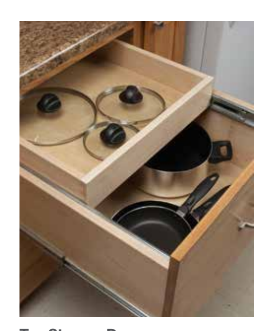
Top Storage Drawer