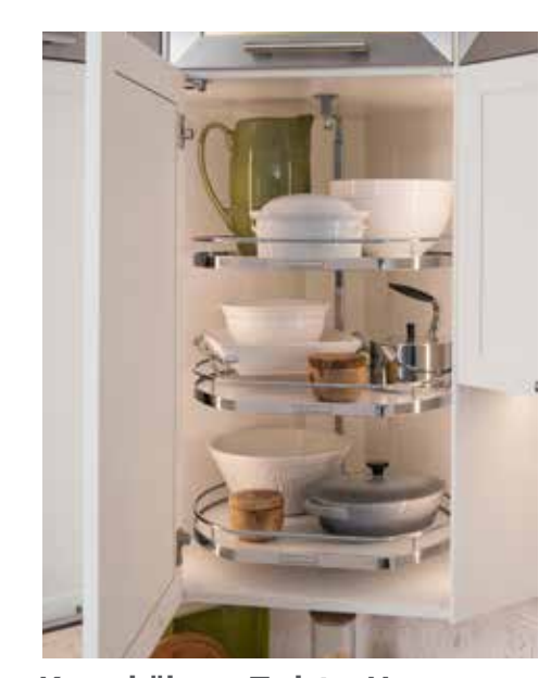
Kesseböhmer Twister Upper