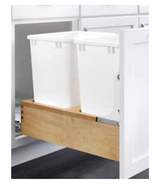
Waste/Recycle Pull Out