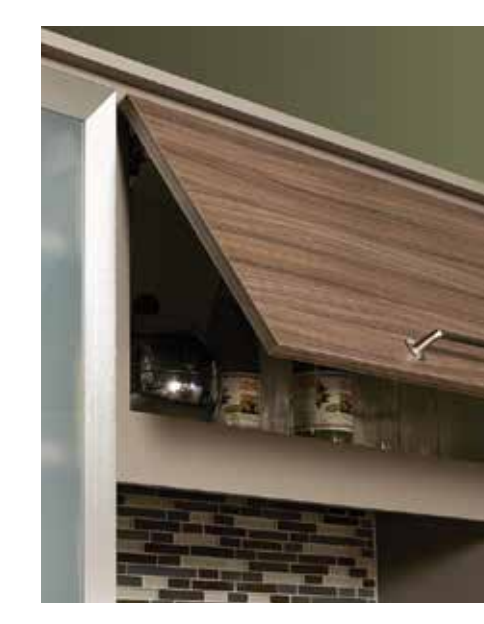
Tilt Up Hinge