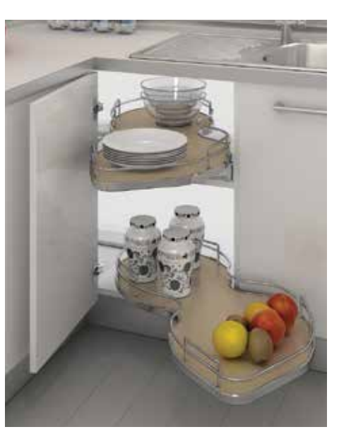
Blind Corner Swing Out Shelves