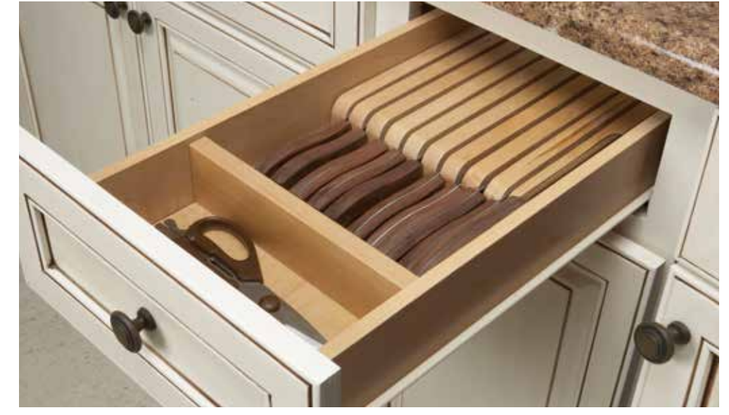
Knife Block Insert