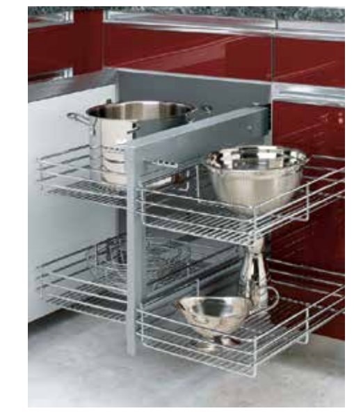
Blind Corner Optimizer