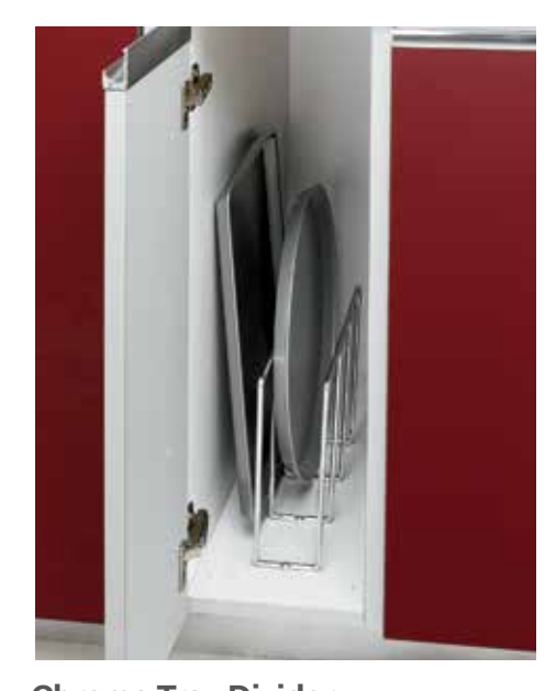
Chrome Tray Divider