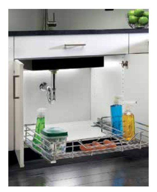
U-Shaped Chrome Pull Out Basket