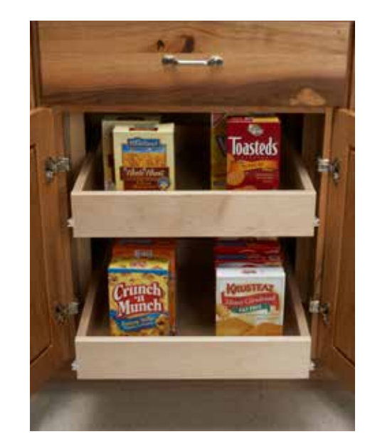
Roll Out Trays