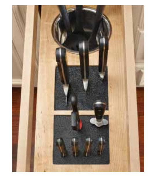
Knife & Utensil Pull Out