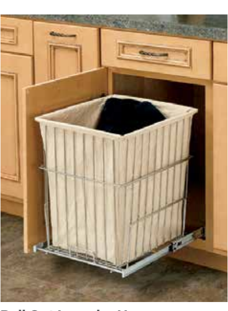
Pull Out Laundry Hamper