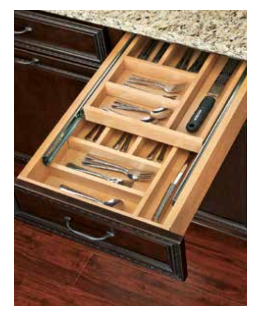
Two-Tiered Cutlery Drawer