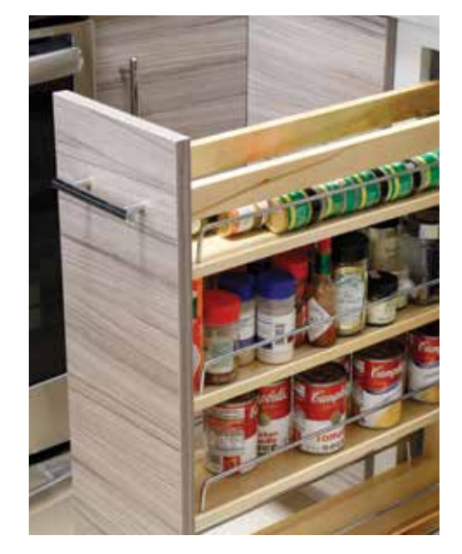
Mini Pantry/Spice Pull Out